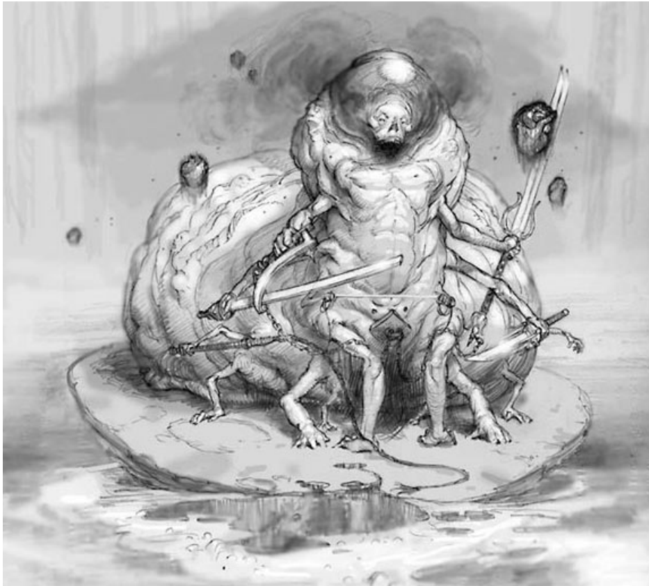
Kagemaro, First to Suffer sketch by Adam Rex

Here we see the bloated form of this Wrath -on-legs. On a lot of legs. As we can see, Adam chose to represent Kagemaro's power and corruption through a multitude of weapon-wielding limbs, a swollen body, and a breath of black vapor. The energy objects floating around him are disturbingly muscular or organlike , and he squats on some kind of fungal throne in the swamp.